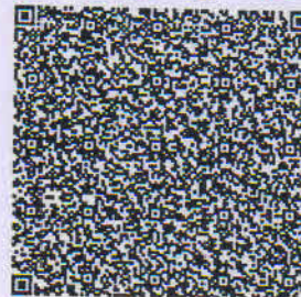
E-Invoice QR Code